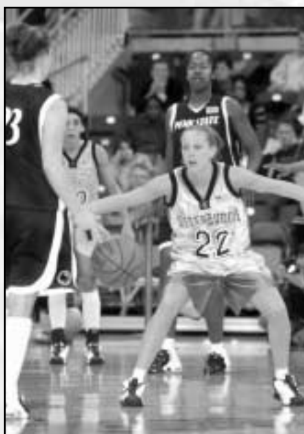
Pittsburgh knocked off No. 12 Penn State, 92-88, in overtime during the 2002-03 campaign at the Petersen Events Center.

• Big East Conference game Total Points (1,484-Pitt; 1,792-opponents)